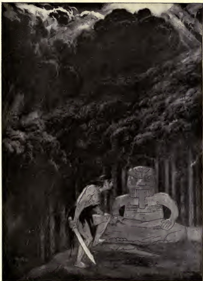
THE SILENCE OF CED